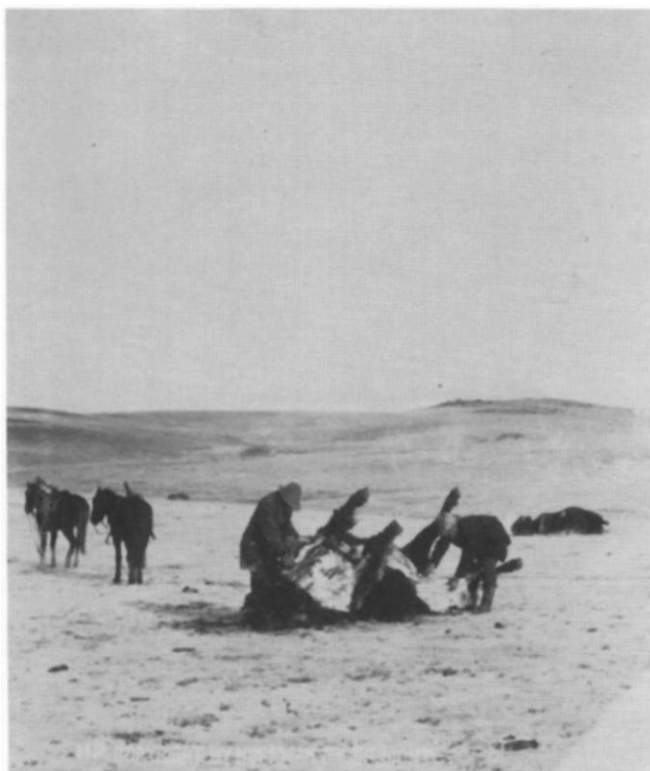
Buffalo Skinners at Work.

The “buffalo runners,” as the hunters liked to call themselves, decimated the central plains herds with shocking rapidity. In the fall of 1873, Lieutenant Colonel Dodge described the devastation that the hide hunters had wreaked in Kansas: “Where there were myriads of buffalo the year before, there were now myriads of carcasses. The air was foul with a sickening stench, and the vast plain, which only a short twelvemonth before teemed with animal life, was a dead, solitary, putrid desert.” 42