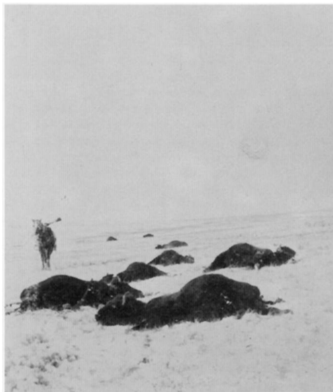
Buffalo killed, Smoky Butte, Montana.

accomplished soldier marksmen and riders as escorts for the visitors, thereby making the hunts all the more destructive. 10