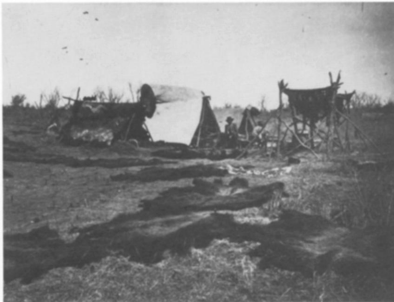
A buffalo hunting camp in Texas.