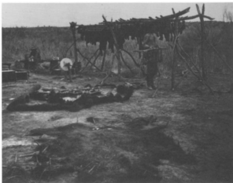
Buffalo hunters camp, Texas Panhandle, 1874.