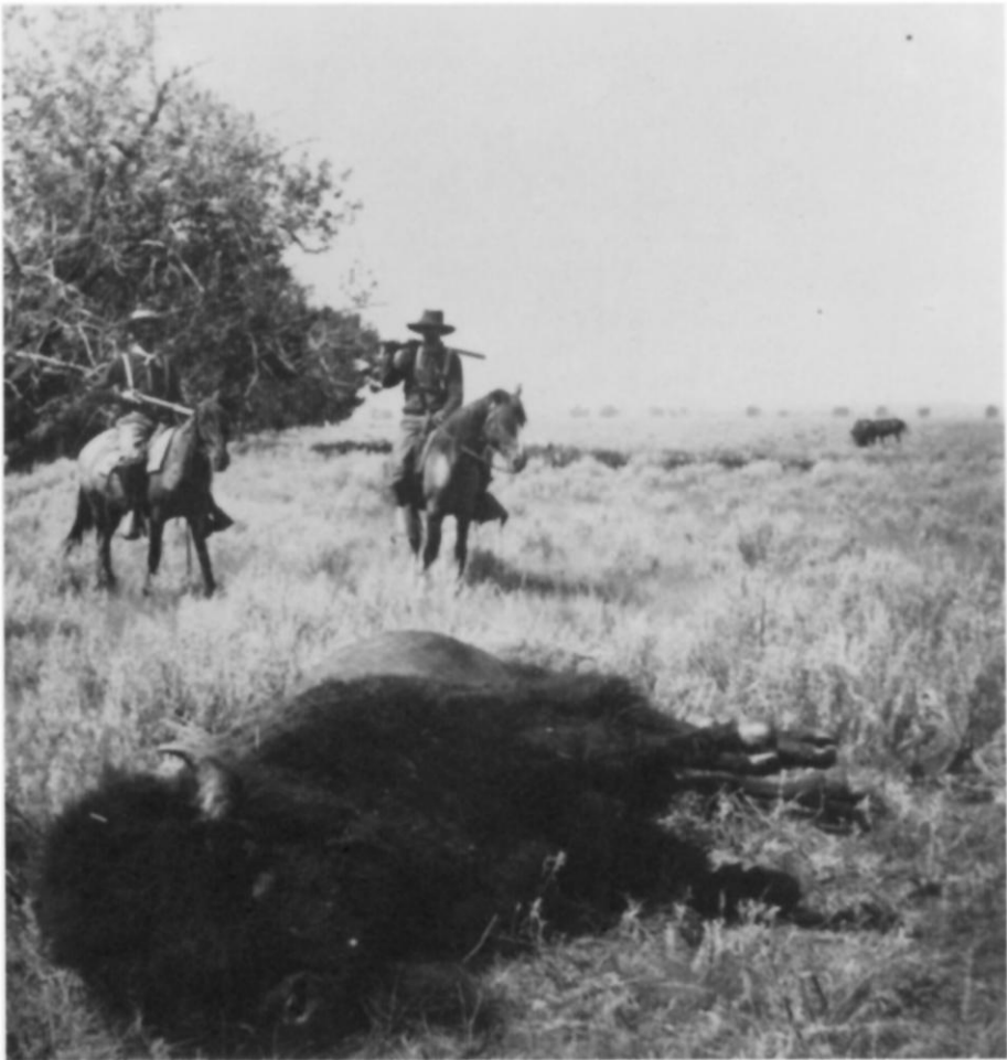
Buffalo hunting, Montana, 1882.